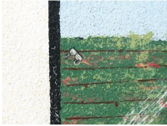
Butterfly – on the flowers in the flowerpot