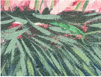
Penny – on top of the awning under the letter “N”