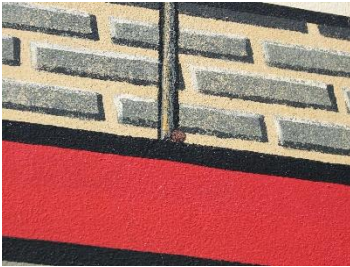
Thimble – on the shelf of plants